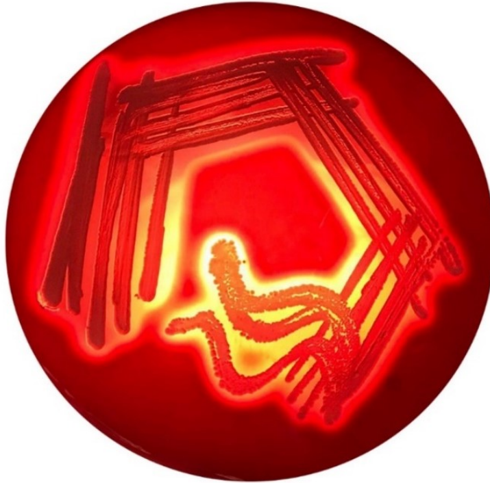
Figure (2): Methicillin resistant staphylococcus (MRSA) cultured on blood agar, showing the beta hemolysis of RBCs.

Previous publications data revealed that nasal carriage of MRSA in general population was 6.3% and 17.8%, while among health care workers the prevalence of MRSA was 18.2% and 43.8% (Hartman and Tomasz, 1984; Yamasaki and others, 2019). On the other hand, a study revealed that 29.7% of the third year of medical student carried of Staphylococcus aureus but not MRSA (Treesirichod and others, 2013). A study that carried in Oman, data showed 311 participants enrolled, nasal colonization with HA-MRSA was found in 47 individuals (15.1%). HA-MRSA was also isolated from the cell phone surfaces in 28 participants (9.0%), 5 participants (1.6%) showed positive results both from their nasal swabs and from their cell phones. Antibiotic resistance to erythromycin (48%) and clindamycin (29%) (Pathare and others, 2016). These data were relatively close to our date that showed 56.2% and 51.2 % for erythromycin and clindamycin respectively. Furthermore, vancomycin-resistant was 9.3% of isolated MRSA from nasal carriage (Pathare and others, 2016). Our results showed no resistance of isolated MRSA to vancomycin antibiotics among health workers. Another study showed that MRSA resistance to wide range of antibiotics which