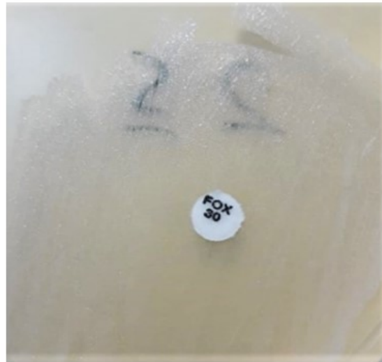
Figure (2): Cefoxitin disk diffusion test (30 \mu g) on Mueller-Hinton agar showing growth (resistance) of MRSA against Cefoxitin disk (FOX= Cefoxitin; susceptible: > 22 mm).

colonization is independent of skin colonization in the same participant. Meaning, colonization of MRSA in the nasal sample is not necessarily faced its colonization of MRSA in skin sample. Chi-square statistical analysis between nasal and skin colonization in the same participant showed no significant difference with P value (0.079) (Figure 1). That means the nasal colonization is totally independent of skin colonization in the same person.